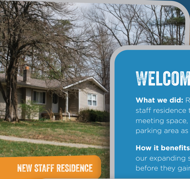
NEW STAFF RESIDENCE

As we get ready to revamp and relaunch the “A Place for You” capital campaign, we’d like to take a moment to thank everyone for all the contributions we’ve received so far. Here’s a quick look at all the projects we were able to complete before hitting “pause” on this campaign during COVID: